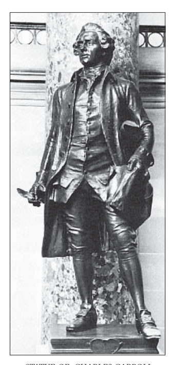
STATUE OF CHARLES CARROLL AT THE US CAPITOL