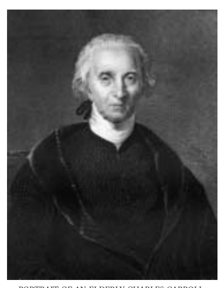
PORTRAIT OF AN ELDERLY CHARLES CARROLL THAT HANGS IN THE US CAPITOL