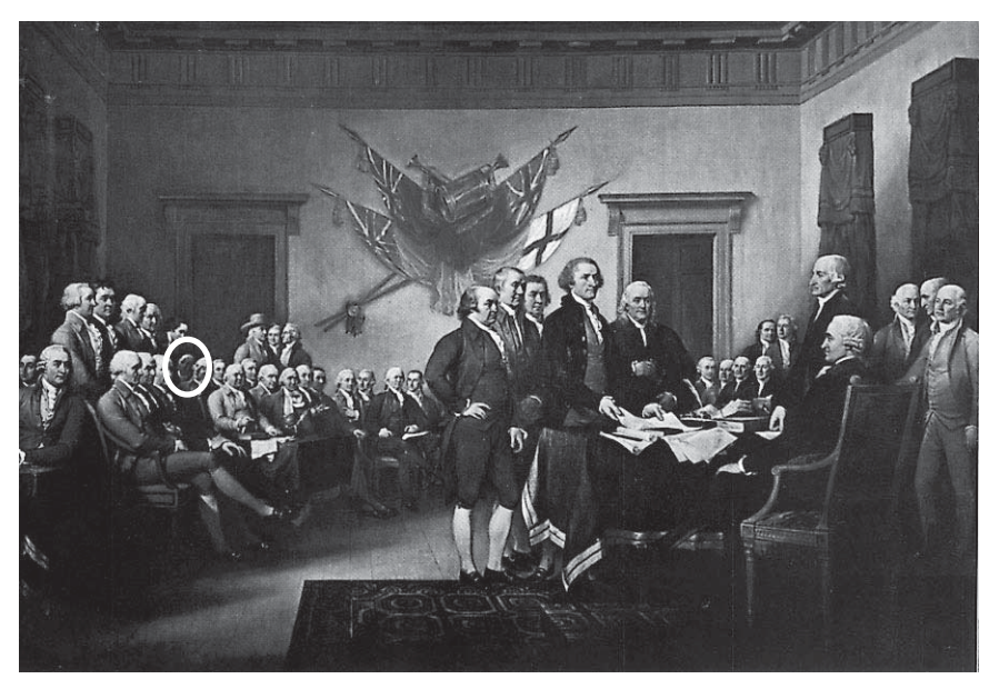
charles carroll at the signing of the declaration of independence when that State constitution was ratified, Carroll left the Continental Congress and returned home to serve as a State Senator, where he was elected President of the State Senate.

In 1787, Carroll was appointed as a delegate to the Constitutional Convention to draft the U.S. Constitution, but he declined that appointment. Following the ratification of the U.S. Constitution, he was elected as an original U.S. Senator from Maryland and helped frame the Bill of Rights (the first ten Amendments to the U.S. Constitution). In 1792 when a law was passed prohibiting individuals from serving in two legislative bodies at the same time, Carroll resigned his position in the U.S. Senate in order to remain in the State Senate. Nine years later, in 1801, he retired completely from all public office.